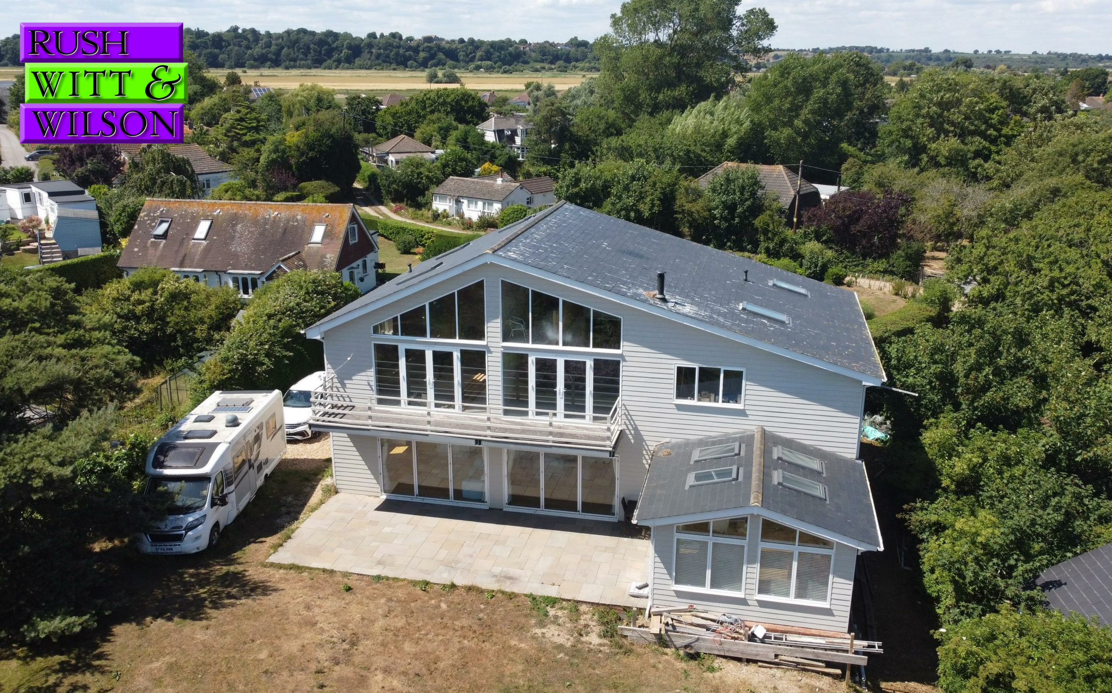
Long Barn Smeatons Lane, Winchelsea Beach, East Sussex TN36 4HW Guide Price £1,245,000